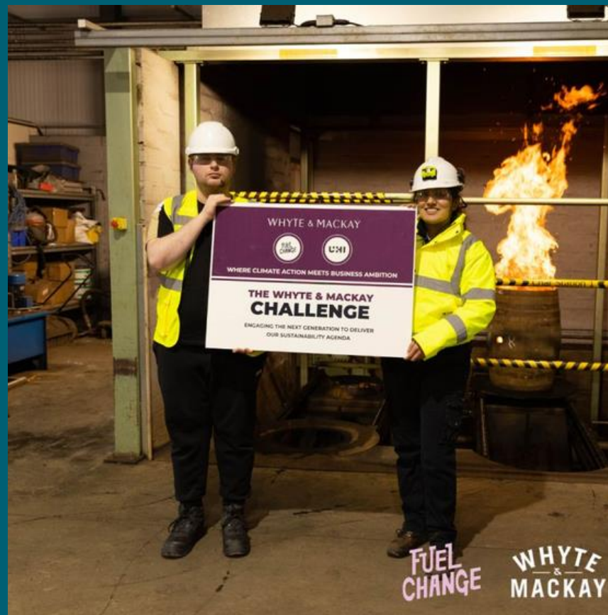
Bespoke Business Programme